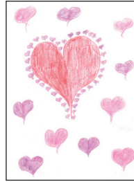
10) Artist Unknown