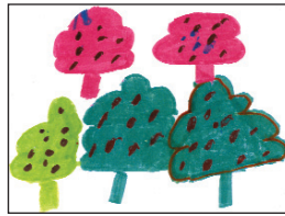
4) Cory Bracone